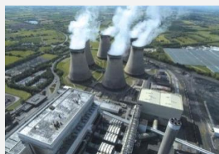
Drax Power Station