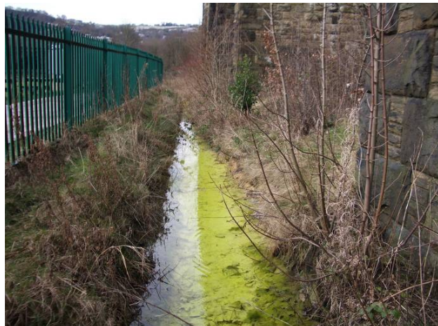
Highly alkaline chromate contaminated ditch water at a legacy chromium ore processing residue disposal site in the North of England

Supervisors: Doug Stewart, Rob Mortimer and Ian Burke