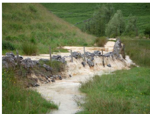
Calcite precipitation where water leaching highly alkaline lime production waste emerges to atmosphere at a site in the Peak district

The project: The use of biological ground treatments has been proposed for the in situ immobilisation of contaminant metals and radionuclides, thereby reducing their associated environmental risk. There has been a great deal of laboratory investigation