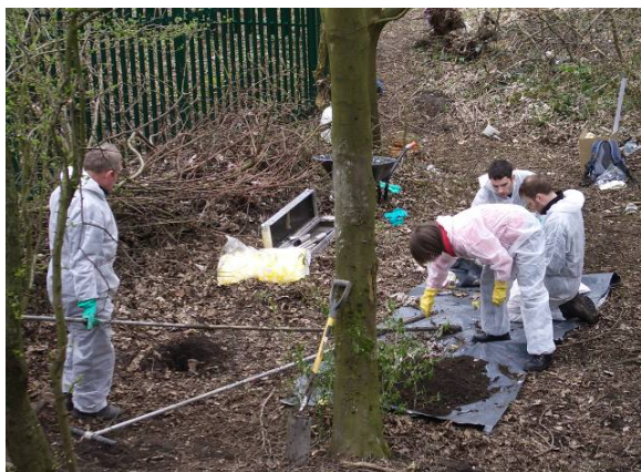
Sub-soil sampling at a contaminated site

Methodology: Field sampling will be undertaken at a number of industrially contaminated sites. Samples